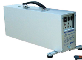
Tapping Machine BAS004