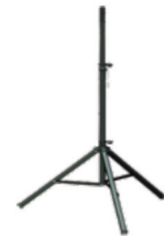
Heavy Duty Tripod TRP023