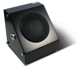
Directional Source BAS003