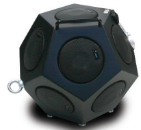
Omnidirectional Source BAS001